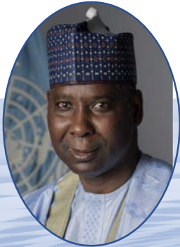
H.E. Tijjani Muhammad-Bande President of UNGA