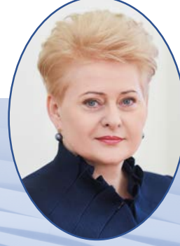
H.E. Dalia Grybauskaitė former President of Lithuania, FACTI Panel Co-chair