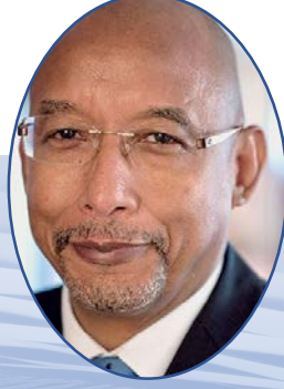
H.E. Ibrahim Mayaki former Prime Minister of Niger, FACTI Panel Co-chair