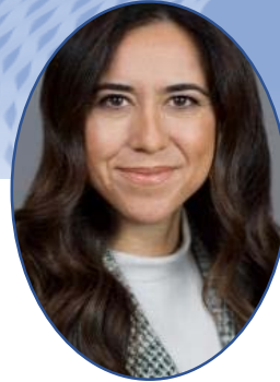
H.E. Lana Zaki Nusseibeh Permanent Representative of United Arab Emirates