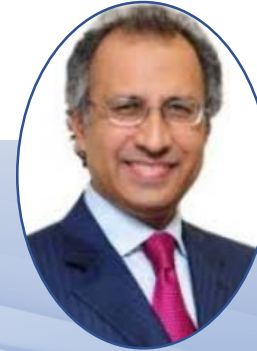
Mr. Abdul Hafeez Shaikh Advisor to the Prime Minister of Pakistan on Finance and Revenue